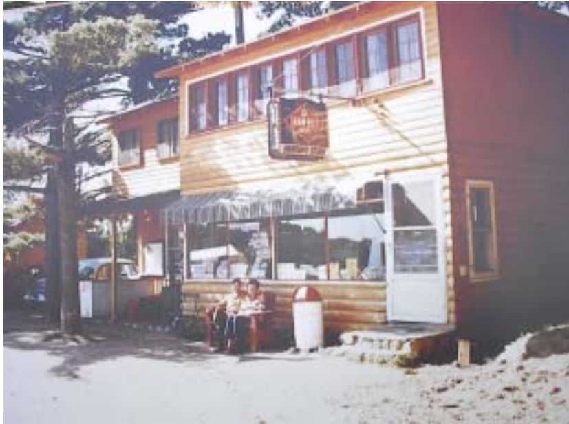
Curt and Ruth Hansen relax in front of the original Hunter's Bay Store, built in 1933. They rebuilt the old store in 1975.

friends – fun to watch many of the kids who grew up around the store now coming in with their grandchildren.